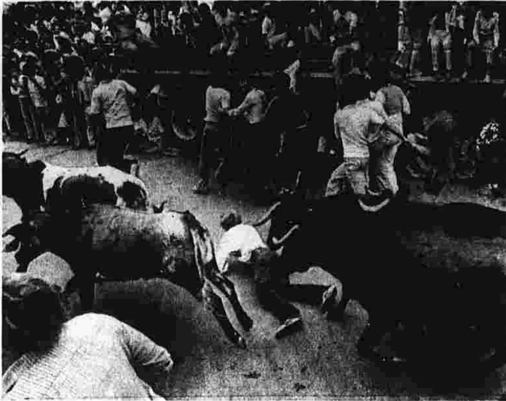
On the Hoof