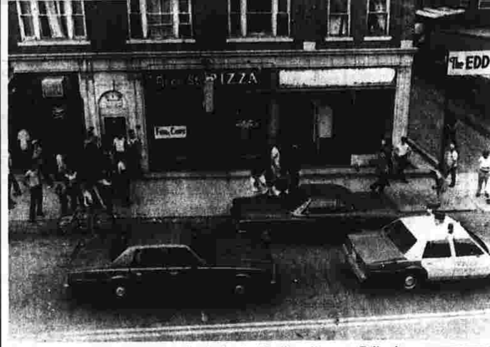
Police cars and spectators gather in front of the Arch Street Pizza House in New Britain Monday afternoon. Police have a young man in custody in connection with the double shooting.

A Family Newspaper Since 1881 • 20¢ Single Copy • 15¢ Home Delivered